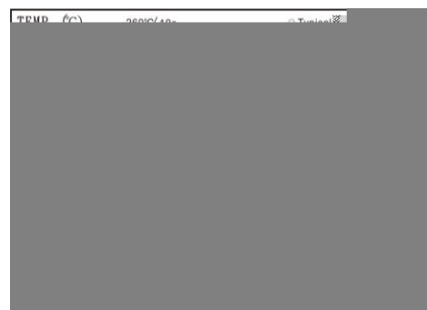
Wave Soldering (Flow Soldering)